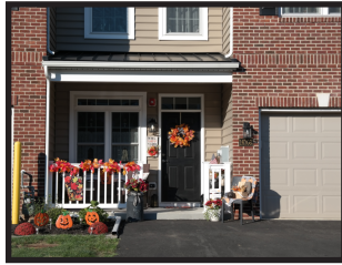
House B. 16767 River View Circle – not in walking distance

This townhome, owned by the daughter and son-in-law of the 16708 property has an open floor plan. The brick front matches the historic architecture of the Borough. There are hardwood floors throughout the first floor. There's a gourmet kitchen, with a large island that opens to the family room.